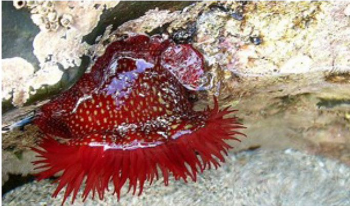
Strawberry Anemone