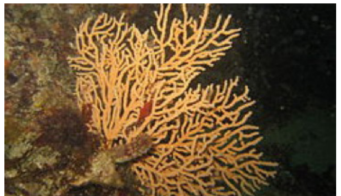
Pink sea fan.