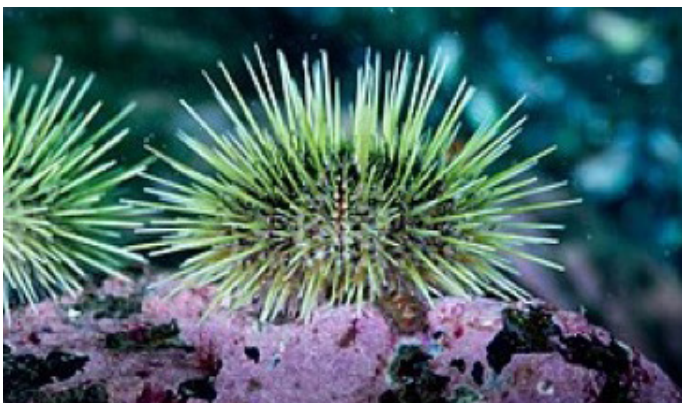
Sea Urchin