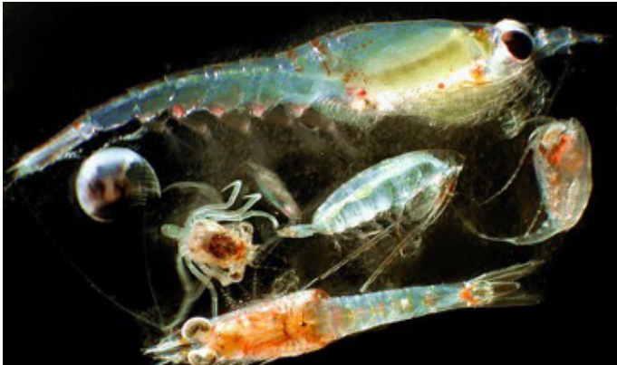
Zooplankton