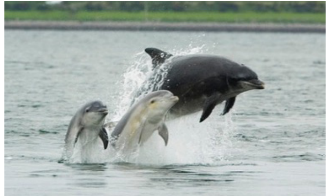
Bottlenose dolphin (Peter Asprey, Wikimedia)