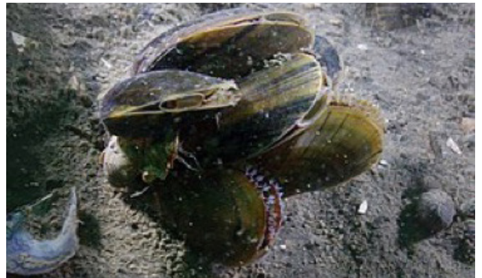
Mussel (Wikimedia Commons)