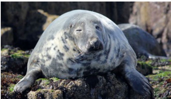
Grey Seal